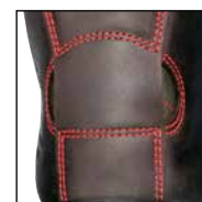
HAIX® FP System