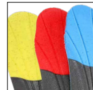
Vario Wide Fit System