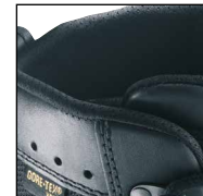
Soft upper shaft edge trim