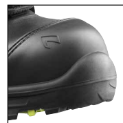
HAIX® Composite Toe Cap