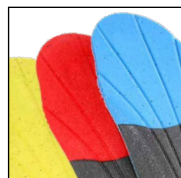
Vario Wide Fit System