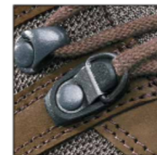
HAIX® 2-Zone Lacing